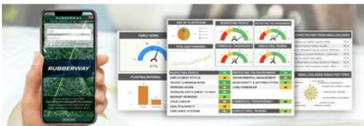
Fig 1. The RubberWay mobile application and web dashboard

This data is then aggregated and analyzed on a web dashboard, where risk scores are presented according to themes. These risk scores are visualized on a customizable dashboard, and in geographic space on an interactive world map.