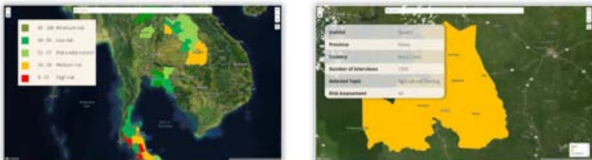
Fig. 3 For smallholder supply sheds, RubberWay summarizes risks by jurisdiction for rapid analysis

RubberWay was developed specifically to tackle the complexity of smallholder farmer dominant supply chains, which comprise a staggering 85% of world production. The mobile application overcomes issues of accessibility, and interviewers can be easily trained to deploy the questionnaire in the field. To address issues of quantitative complexity, where one processing factory can have tens of thousands of potential smallholders, RubberWay uses a statistical jurisdictional approach, where collected data is aggregated by jurisdiction to understand trends. This allows risks to be identified and tackled quickly.